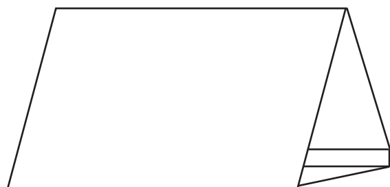
Finished Table Tent